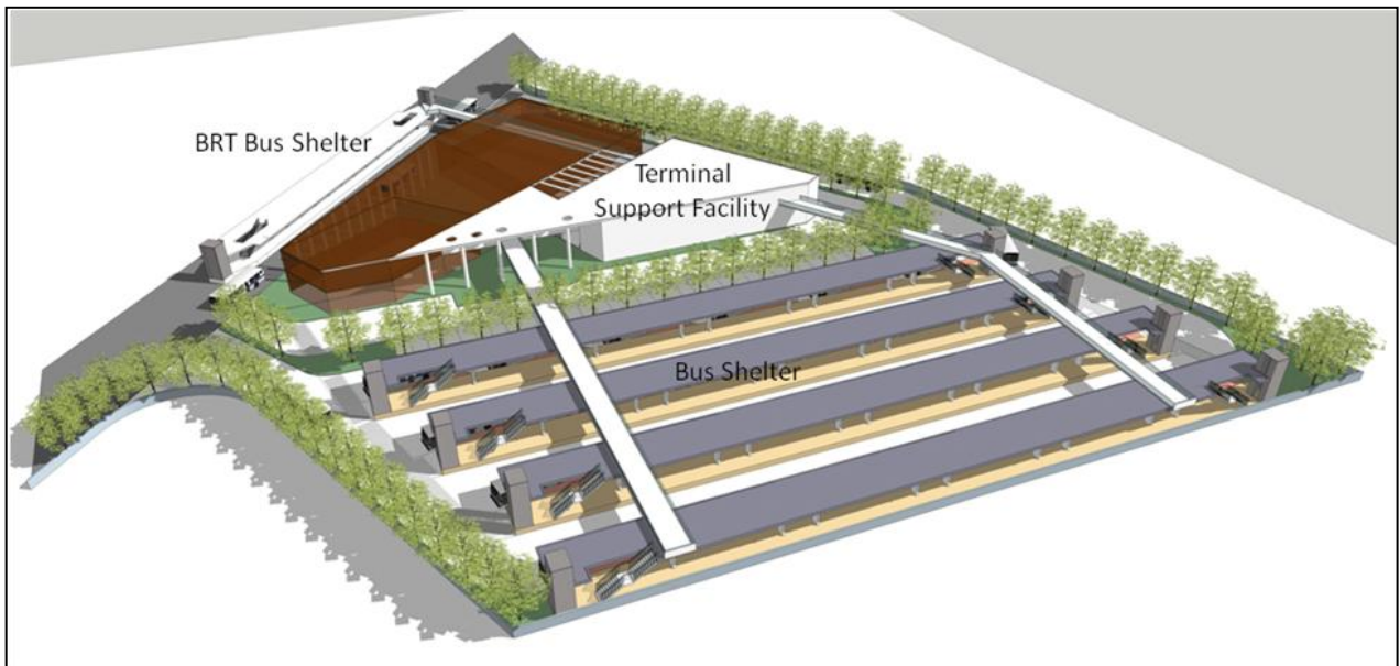
Figure 3: Conceptual Plan of landscaping within bus terminals

greenary, and would be used for people to sit, chat or rest. Innovative, comfortable and attractive street furniture would be placed. The niches should be visible to prevent unsavoury uses and would be properly lighted. A mix of trees, shrubs etc would be considered. However, monoculture plantations would be avoided.